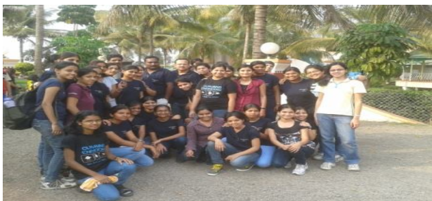
T.E. students during Industrial Visit at Phaltan