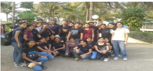
T.E. students during Industrial Visit at Phaltan